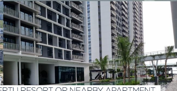
OFF-CAMPUS ACCOMODATION AT VERTU RESORT OR NEARBY APARTMENT *UOWM KDUPG does not provide on-campus accomodation